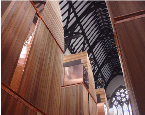
Above: The futuristic three story homes clad with cedar and copper line the central aisle.