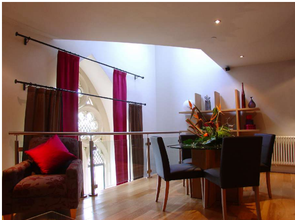
Above: Lounge area with three story gallery