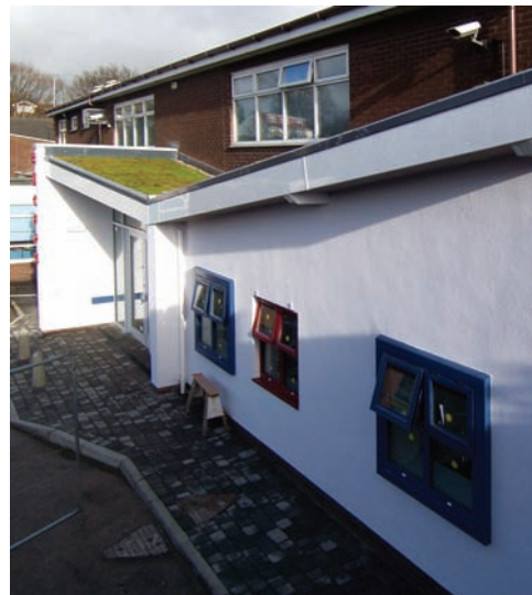
Left & above right: The new entrance. Right: The new interior. Below: The entrance as it was.

A second floor extension will provide the school with a much-needed multi-purpose hall. Makin Architecture's environmentally conscious design will mirror the new butterfly roofed entrance and will again incorporate green measures such as a green roof, high levels of insulation, and lighting on sensors to minimise waste. Makin's architects have also specified environmentally sound Glulam beams; laminated timber beams, made from purpose planted forests, they are virtually maintenance free and cost effective compared with concrete or steel. The scheme is programmed to be on site and completed by April 2010.